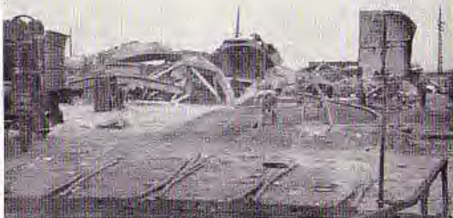
LE MANS — FRANCE.